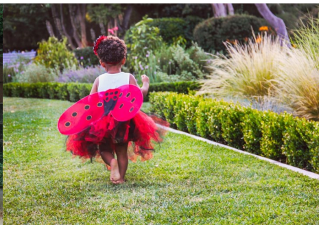
Enjoy neighbours and share your garden secrets in Royal Oak