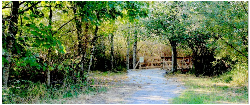
Quick's Bottom Park: visit this nature sanctuary in Royal Oak